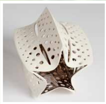
The international Bionic-Award Inspiration: Diatoms Materials: Porcelain and Platinum

In 2012 the international Bionic-Award will be presented for the third time. The award ceremony will take place during the congress »Bionik-Wirtschaftsforum« in 2012. Appropriate information will be communicated to candidates in good time and will be available on the website of the international Bionic-Award. The award-winning work will also be presented during this congress.